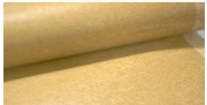
Inhibits silica & inorganic scales