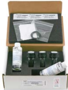
Calibration Kit, 100, 10 & 0.02 NTU/FNU