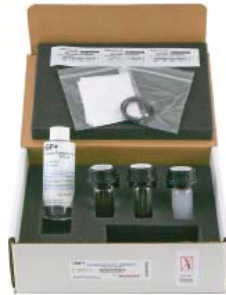
Calibration Kit, 1000, 10 & 0.02 NTU/FNU

The Calibration Standard kits contain fluids in special cuvette bottles that are used to compare the clarity of the process water against the standard to calibrate the turbidity instrument. The standard kits come in two pre-mixed, calibrated ranges.