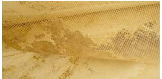
Removes inorganic deposits

Available in 25 kg kegs, 250 kg drums and 1,300 kg IBCs. The shelf life is two years under normal storage conditions.