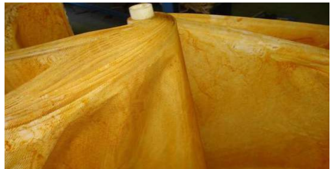
Removes Iron Deposits