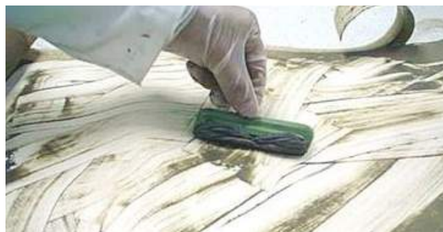
Removes Organic Fouling

The shelf life is two years under normal storage conditions. Ensure the packaging remains well sealed and the Genesol 703 remains dry.