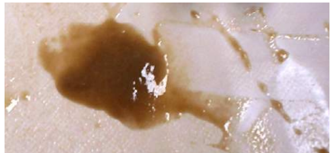
Effective at Biofilm Removal