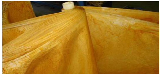
Removes Iron Deposits