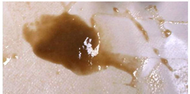
Effectively removes membrane biofilms

Available in 10 kg and 25 kg plastic pails and 1,000 kg bulk bags. Under normal storage conditions the shelf life of Genesol 734 is 1-2 years. Ensure the packaging is sealed after use and the Genesol 734 remains dry.