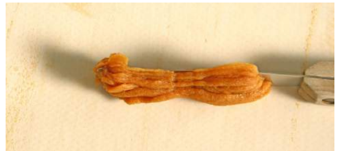
Disrupts biofilm to maintain clean membranes