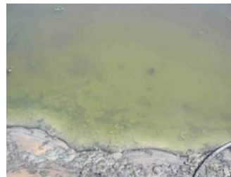
Inhibits algae and bacteria

Genefloc ABF is a viscous liquid at low temperatures.