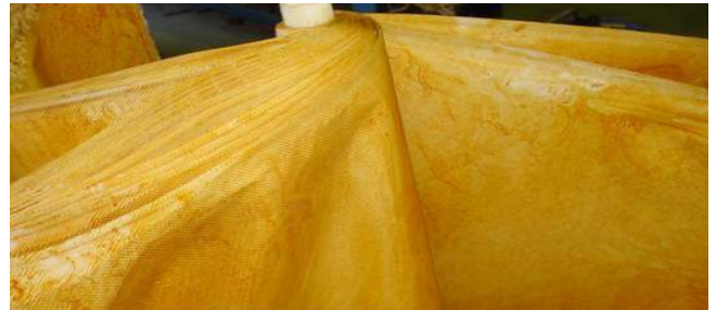
Prevents Iron Fouling