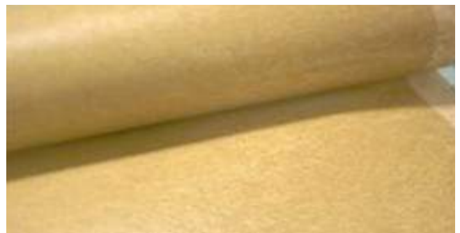
Inhibits silica & inorganic scales