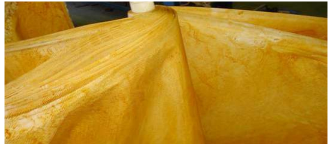
Prevents Iron Fouling